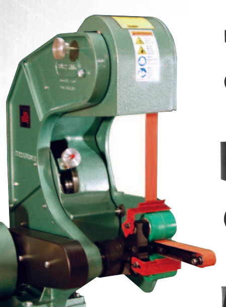
Contact Arm #1423

• Versatile • Reliable • Powerful • Smooth Aggressive • Heavy Duty